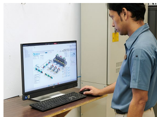
savic-net G5 monitors the operating status of HVAC equipment. By collecting data, it is possible to specify areas where energy-saving measures are needed and to confirm the effectiveness of implemented measures.