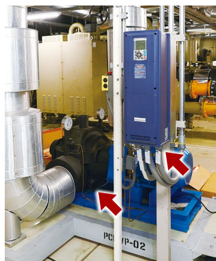
A primary chilled water pump for HVAC equipment (left) and an inverter that controls the pump's rotation speed according to demand (right)